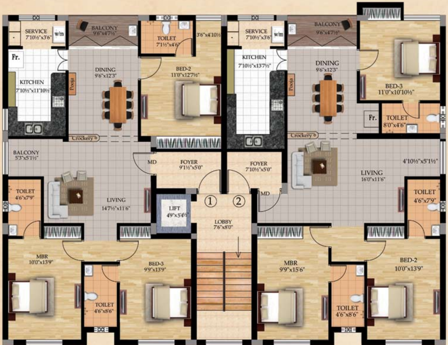
Floor Plan: Typical 1 st & 2 nd Floor