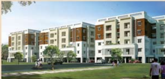
ROYAL exotica , Coimbatore