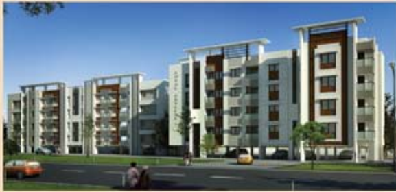
ROYAL Skyline , Coimbatore