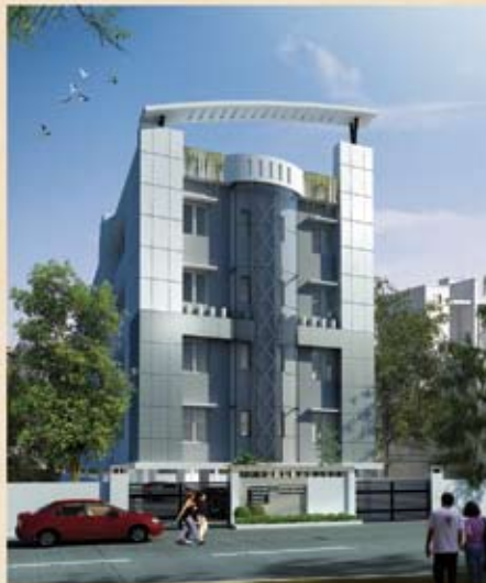
ROYAL Srishti , Chennai.